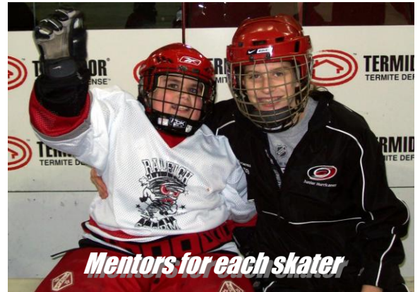
Mentors for each skater